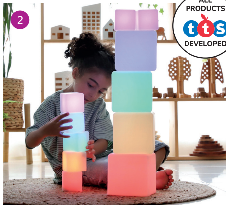
2 TTS SENSORY ICT GLOW CONSTRUCTION BLOCKS 12PK EY06793

A set of seven stackable, illuminating arches with vibrant light options for diverse play. Suitable for age 10 months and up.