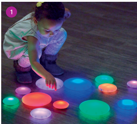
1 TTS GLOW PEBBLES 12PK EY11966

A set of twelve illuminated, rechargeable pebbles in three sizes, four of each. Designed to be stacked and arranged, these pebbles support the development of fine motor skills and an understanding of cause and effect. Suitable for age 10 months and up.